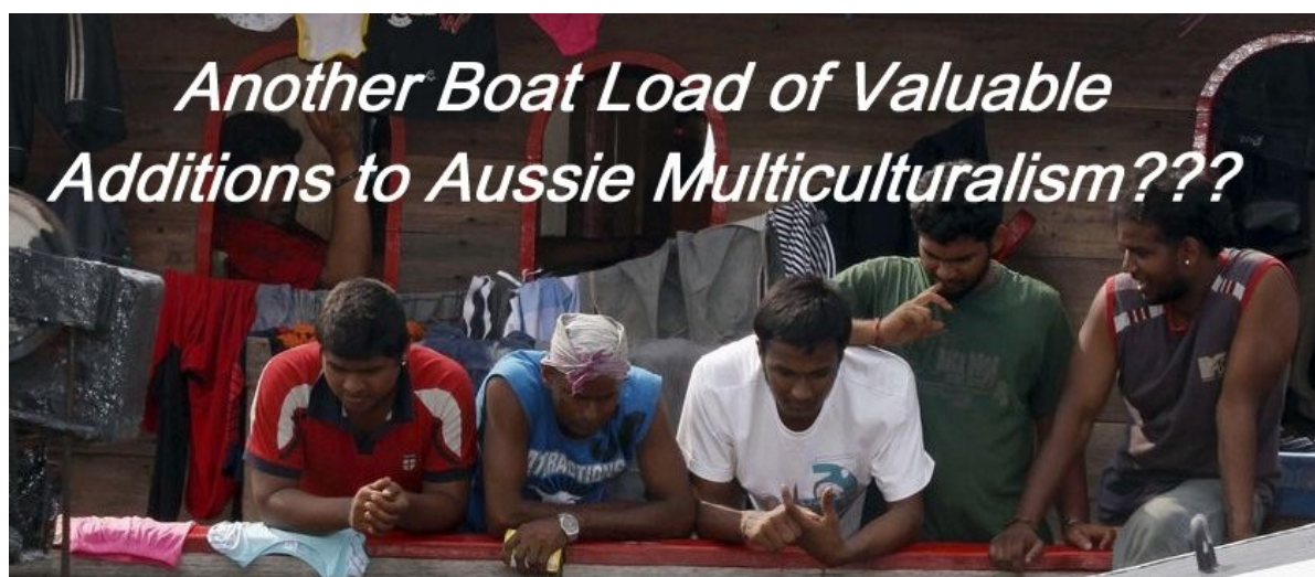
Another gift from the Rudd/Gillard Labor Government!

Labor has failed on all counts and has even conveyed the message to the third world that Australia is a soft touch - Centrelink, free health care for the whole tribe, a house, a car, a team of personal do-gooders to assist plus all the comforts of the first world await – step right up folks! You've just arrived in Paradise!